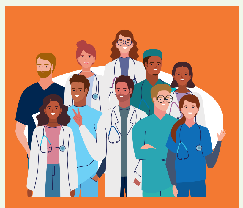
ADJUST P&T COMMITTEE MEMBERS FOR BROADER ADVICE AND QUICKER DECISIONS

COLLABORATE WITH PAYERS TO IMPROVE PATIENT ACCESS TO INNOVATIVE THERAPIES