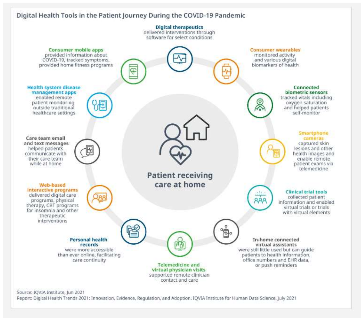
Figure 1. Examples of Types of Digital Health Tools.

Digital health is a broad, multi-faceted term used to describe a broad category of practices, products, and processes (Figure 1). The FDA describes digital health as “the broad scope of digital health includes categories such as mobile health (mHealth), health information technology (IT), wearable devices, telehealth and telemedicine, and personalized medicine. The World Health Organization, in its guidelines on the topic, describes digital health as “a broad umbrella term encompassing eHealth (which includes mHealth), as well as emerging areas, such as the use of advanced computing sciences in ‘big data,’ genomics, and artificial intelligence.” The American Medical Association, in reporting on a 2019 survey , stated that “digital health encompasses a broad scope of tools that can improve health care, enable lifestyle change and create operational efficiencies. This includes digital solutions involving telemedicine and telehealth, mHealth, wearables, remote monitoring, apps, and others.”